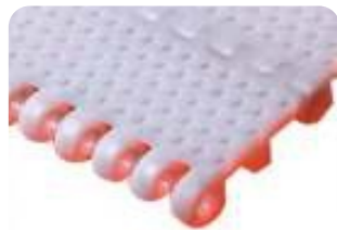
Flush grid 23 % open