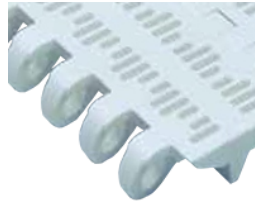
Flush grid 18 % open